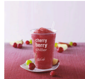
McDonald's McCafé's Cherry Berry Chiller

If your kids are like mine they spend a lot of time in the summer playing outside. They come inside every 30 minutes or so to get ice for their water, an ice pop or if I'm feeling especially generous they get a little cup of ice cream to cool them off. It is very important for kids to stay hydrated so I have no qualms about them enjoying an ice pop or something similar once a day in the summer. This summer the kids can cool off with McDonald's new McCafé's Cherry Berry Chiller!